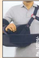
SAS 45 Rs. 10716/-