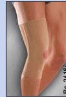
605 Rs. 2416/-