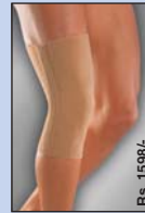
603 Rs. 1598/-