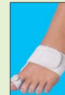
Hallufix Rs. 2992/-