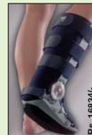
medi. ROM Walker Rs. 16834/-