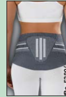
Lumbamed Plus Rs. 5380/-