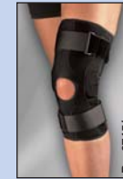
medi hinged knee pro Rs. 6715/-