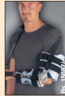
Epicomed ROM II Rs. 15087/-