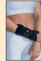
Manumed Rs. 3360/-