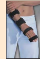
medi CTS Rs. 3397/-