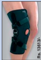
protect. OA soft Rs. 13613/-