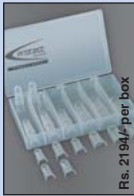
protect. Finger stax Rs. 2194/- per box