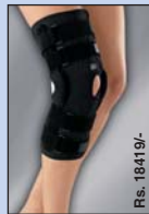
Collamed II Rs. 18419/-