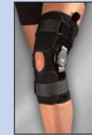
medi hinged knee pro Rs. 9992/-