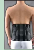
Lumbamed stabil Rs. 8532/-