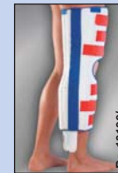
medi PTS Rs. 10126/-