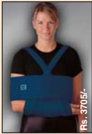
medi shoulder sling Rs. 3705/-