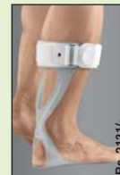
Ankle foot Orthosis Rs. 2131/-