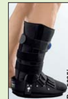
Protect Air Walker Boot Rs. 5295/-