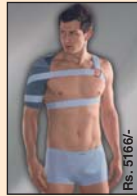
Omomed Rs. 5166/-