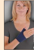
medi thumb support Rs. 1992/-