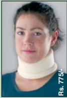
protect. Collar soft Rs. 775/-