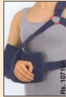
SAS 15 Rs. 10716/-