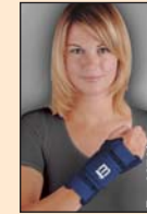
medi wrist support Rs. 2670/-