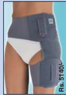
mediortho cox Rs. 5140/-