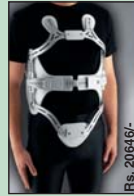
medi 4C Rs. 20646/-