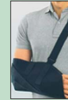
medi Arm sling Rs. 9051/-