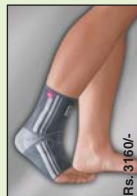
Levamed Rs. 3160/-