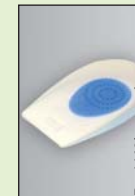
protect. Heel Soft Rs. 1143/- per pair