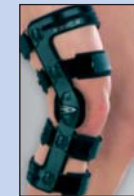
protect. 4 Rs. 19507/-