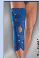
medi Classic 0/20 Rs. 5408/-