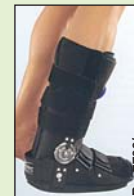
Protect Air ROM Walker Rs. 7703/-