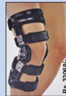
protect.4 OA Rs. 32068/-