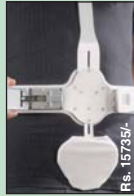
medi 3C Rs. 15735/-