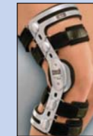
M.4 Rs. 36809/-