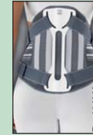
Lumbamed disc Rs. 11429/-