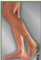
medi elastic ankle support 501 Rs. 726/-