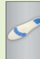
protect. Silicone Insole Rs. 2141/- per pair