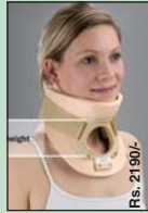
protect. Collar Tracheo Rs. 2190/-