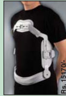
medi 4C flex Rs. 15770/-