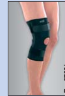
protect. St pro Rs. 6703/-