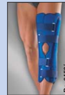
medi Jeans 0/730 Rs. 6450/-