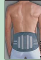
Lumbamed basic Rs. 9570/-