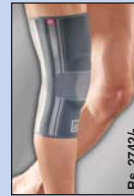
Genumed Rs. 2742/-