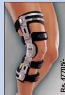
M.4 OA Rs. 47705/-