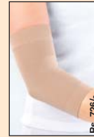
medi elbow support Rs. 726/-