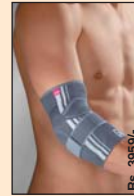
Epicomed Rs. 3959/-