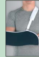
protect. Arm sling Rs. 928/-