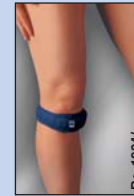
medi patella tendon support Rs. 1834/-