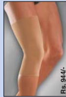
601 Rs. 944/-