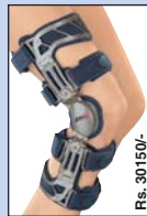
M.3 s OA Rs. 30150/-