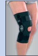
protect. St Rs. 9963/-