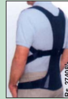
Spinomed IV Rs. 27408/-