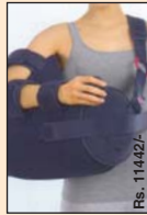
medi SAK Rs. 11442/-