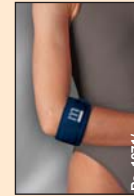
medi elbow strap Rs. 1871/-