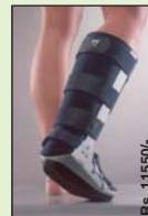
medi Walker Boot Rs. 11550/-