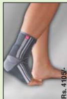
Achimed Rs. 4195/-