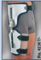
medi hip orthosis Rs. 42387/-