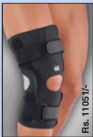
Stabimed II Rs. 11051/-