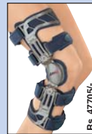
M.4 s OA Rs. 47705/-