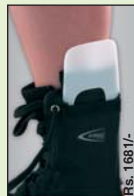
protect. Ankle lace up Rs. 1681/-