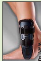
M. Step Rs. 3358/-