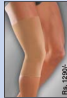
602 Rs. 1290/-