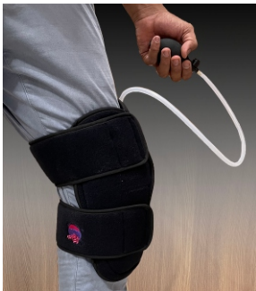
KNEE Rs. 3732/-pc

Our unique Cryotherapy with Compression system