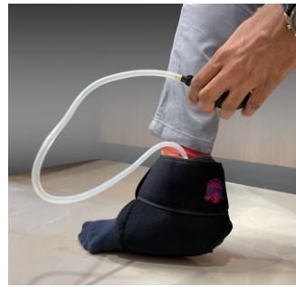
ANKLE Rs. 3732/-pc