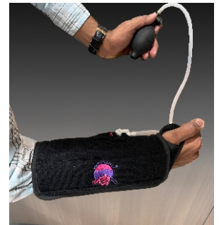
WRIST Rs. 3622/-pc