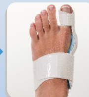
The solution Bunion Aid Splint