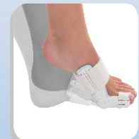
... while maintaining mobility!