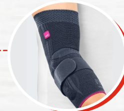
medi Elastic elbow support