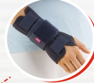
medi thumb support