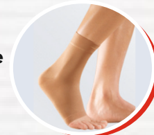
medi elastic ankle support 501

601 Rs. 1701/- pc | 602 Rs. 2243/- pc | 603 Rs. 2835/- pc | 605 Rs. 4227/- pc