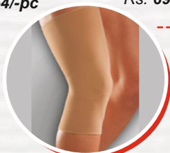
medi elastic knee supports

601 Rs. 1701/- pc | 602 Rs. 2243/- pc | 603 Rs. 2835/- pc | 605 Rs. 4227/- pc