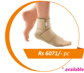
Rs 6071/- pc