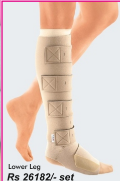
Lower Leg Rs 26182/- set