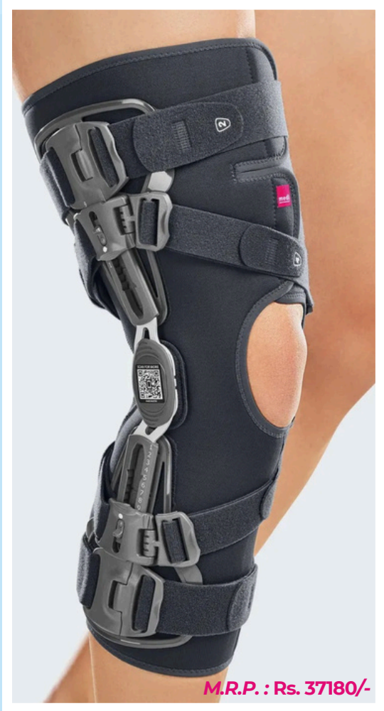
M.R.P. : Rs. 37180/-