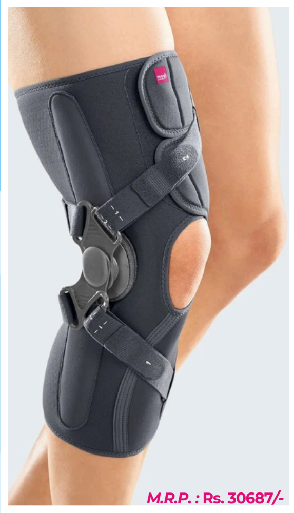
M.R.P. : Rs. 30687/-

Soft orthosis for varus / valgus pressure relief