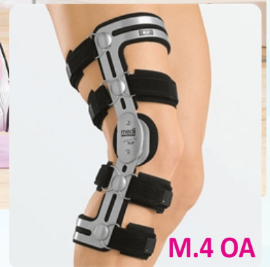
M.4 OA Rs 62786/- pc