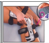
Easy & correct fitting