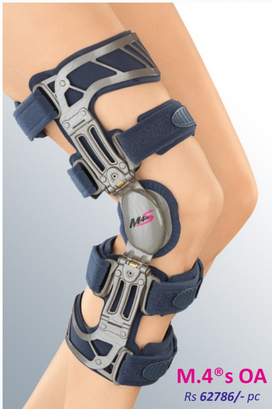
M.4 ® s OA Rs 62786/- pc