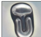
Air Supra Condyle Pad