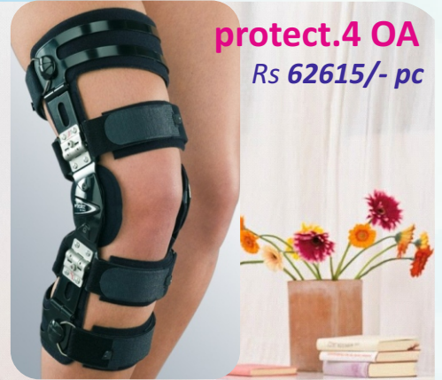
protect.4 OA Rs 62615/- pc