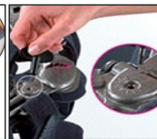
Customised allen key adjustment