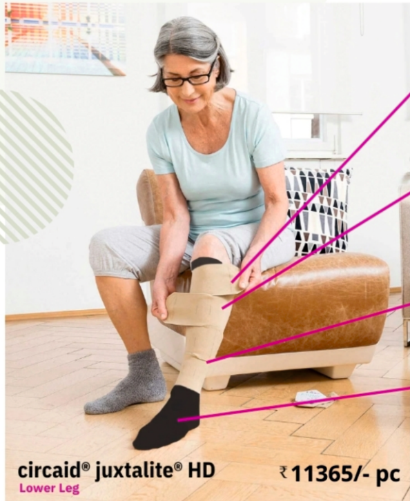
circaid® juxtalite® HD ₹ 11365/- pc Lower Leg

More robust adjustable Compression garment for treating venous oedema