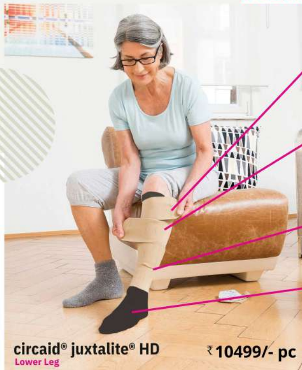
circaid® juxtalite® HD Lower Leg